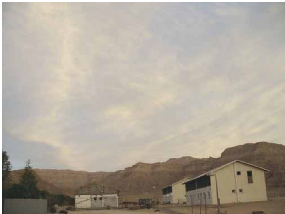
CONSTRUCTION BEGINS on new housing in Samar, in the Arava desert.

Not only is there no tangible use of money on Samar, there is absolutely no personal allowance system. On other kibbutzim, even those that have remained communal and haven't resorted to differentiated pay, each family has an allowance based on the size of their household. That limited budget is the amount they can spend each month, with certain things that are included and others that aren't.