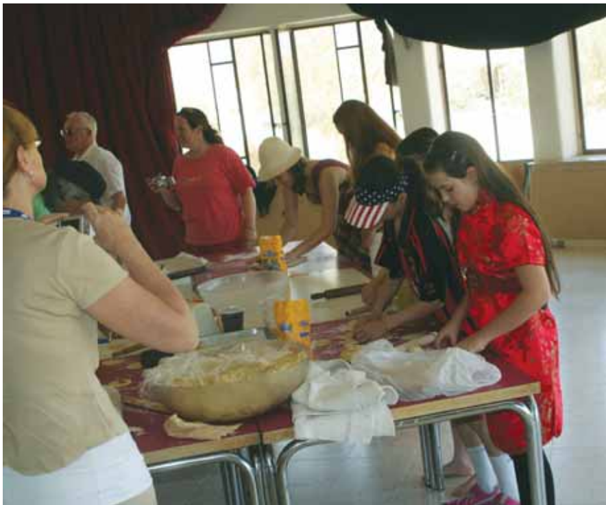
CHILDREN ON the kibbutz make hamantaschen for Purim. All food is free and members are encouraged to take what they need. (Marjorie Strom)