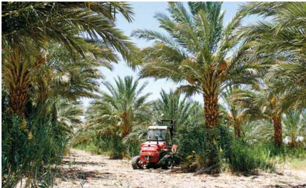
A TRACTOR is seen in the date fields of Kibbutz Samar. Once heavily subsidized by the government, most kibbutzim turned to privatization and capitalism to make money. (Yardena Schwartz)