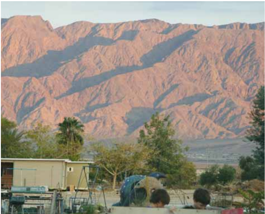
THE SUN sets on a typical collection of homes in Samar. (Marjorie Strom)

“There’s a limit to how much time you demand from someone who’s working for no pay,” says Strom. “They don’t cost as much as a paid worker, but they cost. If you were to do a very strict evaluation of their cost per unit of productivity, they probably cost about the same.”